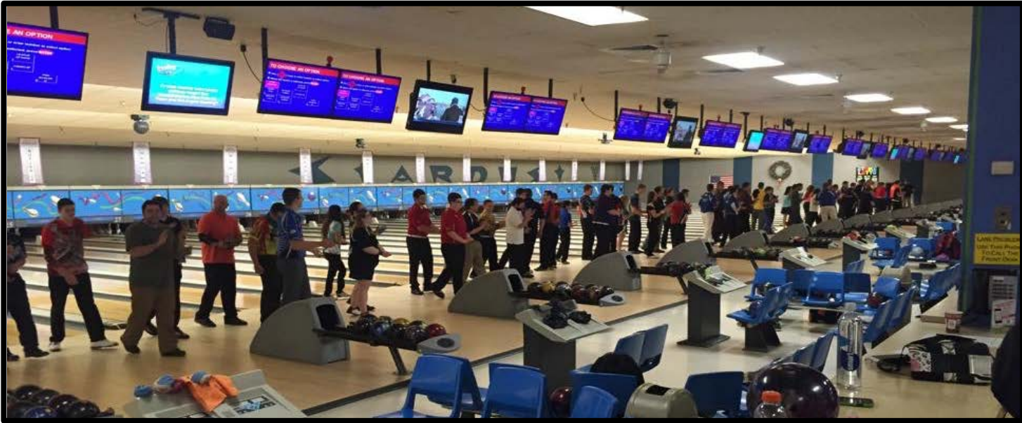
NWIJTPA YOUTH ADULT field fills the 48-Lane Stardust Bowl III center!!

The tour will now take an 8 week break before returning February 21 in Lowell, IN.